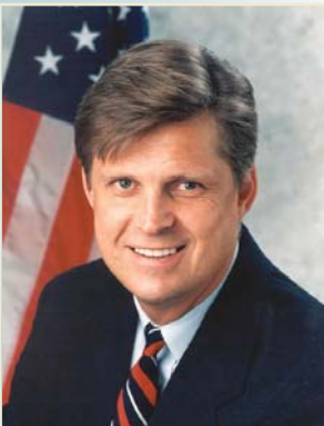
Todd Tiahrt US Representative

U nited States Representative Todd Tiahrt was named "Friend of Rural Water" by the Kansas Rural Water Association (KRWA) during the Association's 41st Annual Conference &