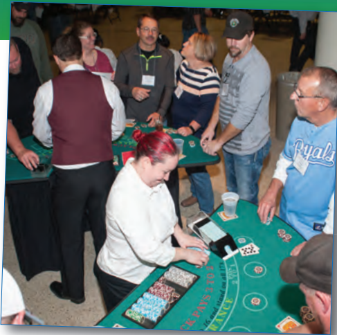
No cheating in this casino. Everyone wins!