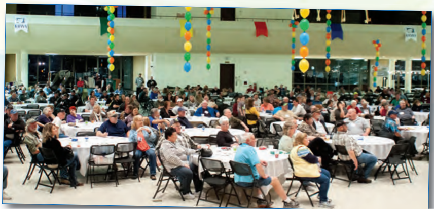
It's about time for prize drawings!