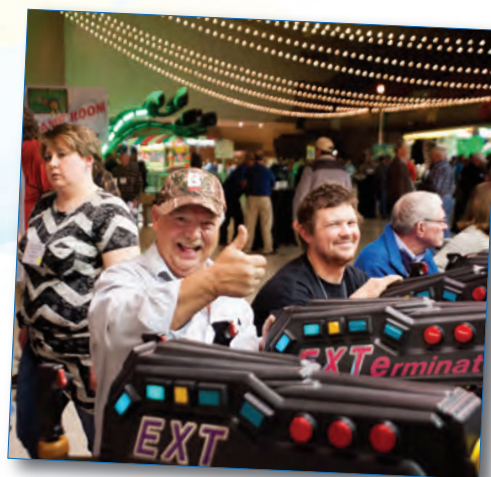
The Exterminator - shoot 'em up!