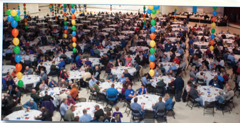
It's time for barbeque.