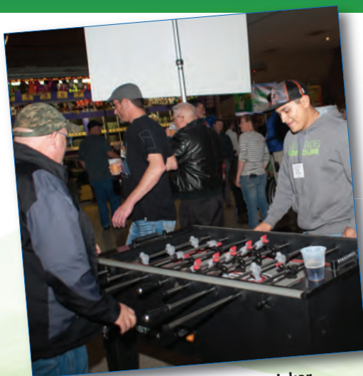
Foosball - your hand must be quicker than your eye.

To say the least, a good time was had by all!