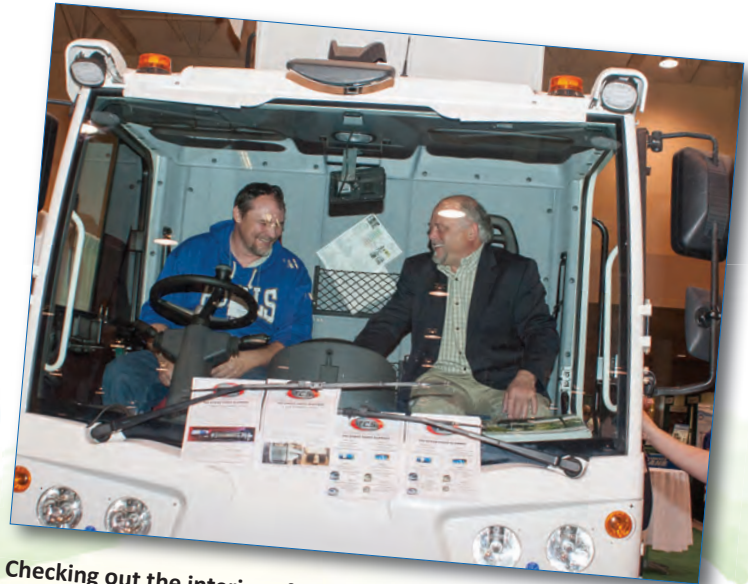
Checking out the interior of the street sweeper on display by Truck Component Services