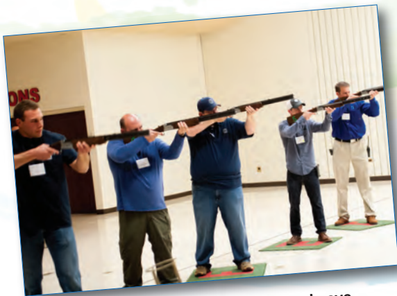
Laser Skeet Shoot takes a steady eye.