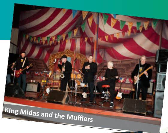
King Midas and the Mufflers

"You really can't go to the same session too often," he said. "Things change, and there are always new problems that need to be solved. There's always something new to learn, it's not just the same old thing."