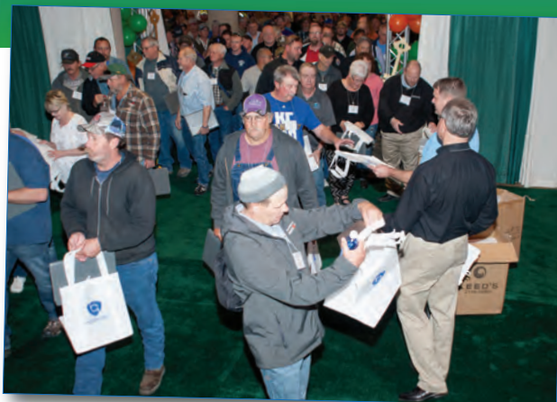
Open the Doors!

The KRWA conference offers opportunities for attendees to visit with and learn from agencies, engineers and suppliers with goods and services.