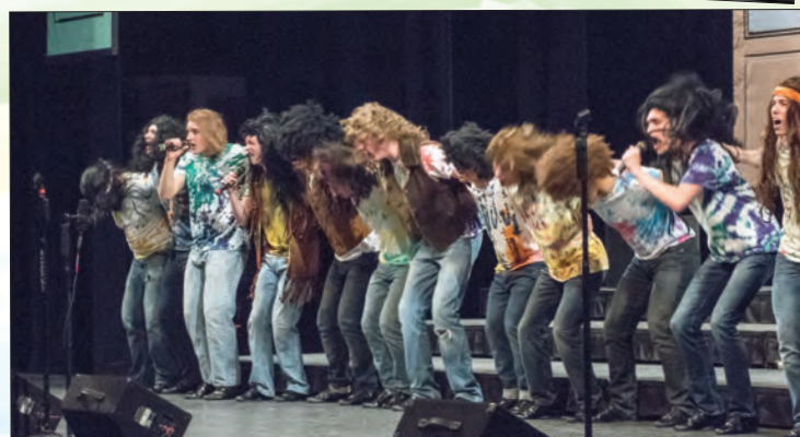
"Hair" – the title song to the 1968 musical Hair .