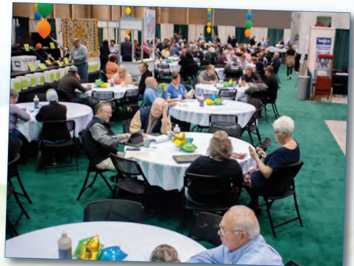
Hospitality Area in Expo Hall was always busy