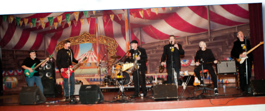
"King Midas and the Mufflers" rocked away the night.