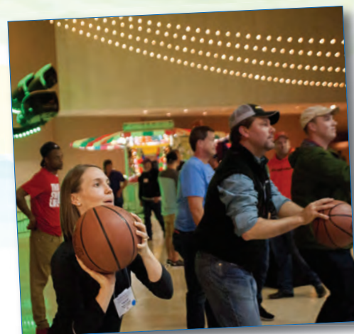
March madness, KRWAs 2017.